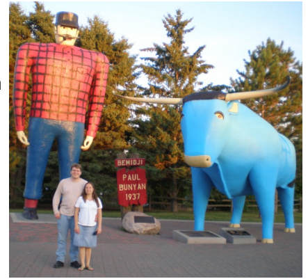
Posing with Paul Bunyan & his blue ox in Bemidji, MN