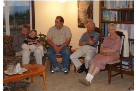
New friends at a home meeting in Sheridan, OR

Now I believe that missions changes lives more through long-term relationships and the unnoticed details that you seldom hear about in newsletters. For example, missionaries typically go overseas as a family: husband, wife, and their children. While the final product of their work may be a new translation of the Bible, the family has also had a positive impact on the people in the area. By the time MK's leave for college, they have made friends and shared their beliefs with many nationals, often over the course of many years.